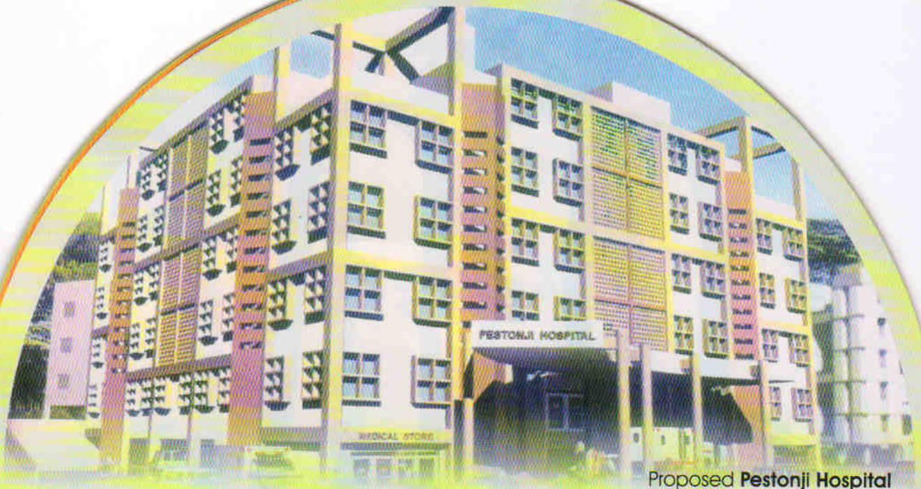
Proposed Pestonji Hospital