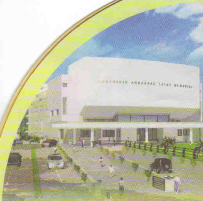
Proposed Lokshahir Annabhau Sathe Memorial