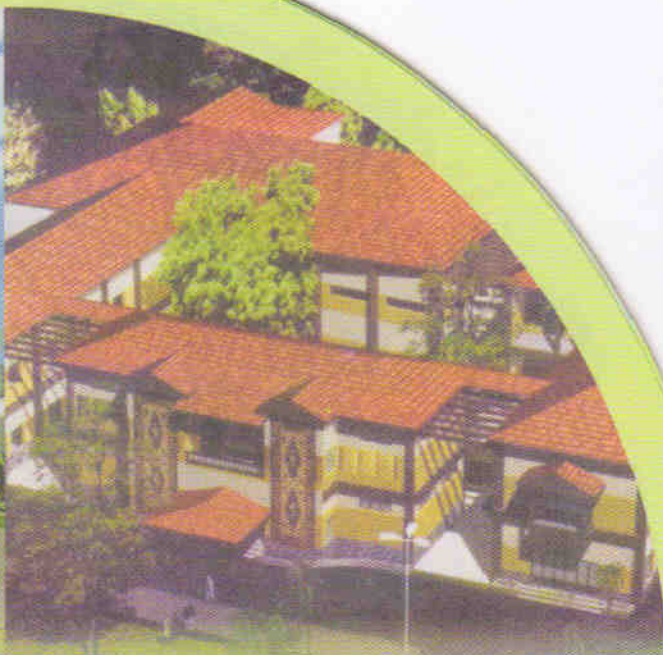
Proposed Savitribai Phule Smarak